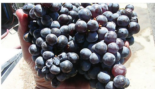
Hand picked grenache