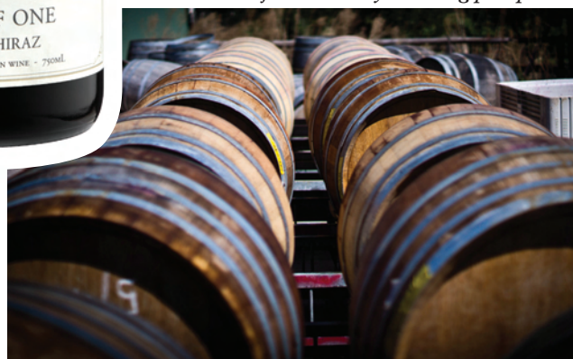
Barrel filling at the Eden Valley winery