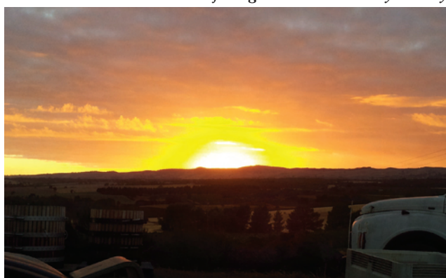
Sunrise, something we see plenty of during vintage