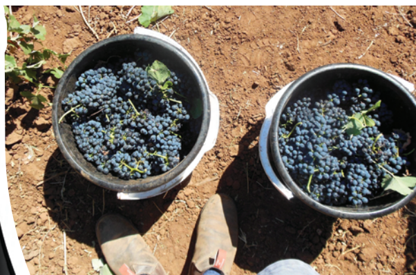
Harvest day - Adelaide Plains old vine